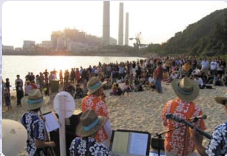
HEC band playing music at the beach near our power station.

Collection pits have been constructed to collect rainwater and reusable effluent for the preparation of limestone slurry, which is used in the flue gas desulphurisation process. A staged reuse of water is practised in our power station. One combined effect of these schemes has been the significant reduction in the amount of town water used by the power station.